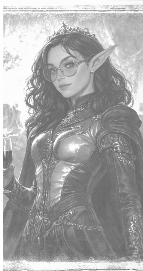
The Empress seen at her welcome home banquet after her kidnapping

History will decide whether this was an act of preservation... or the first page of a war.