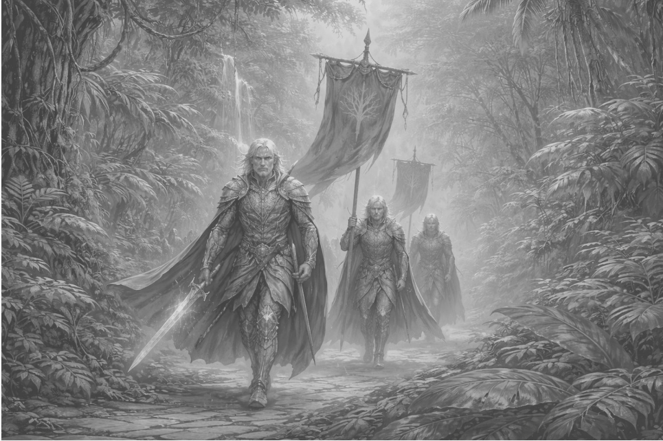
Soldiers spotted marching through the jungles of Ehobel sporting banners not linked to their Empress