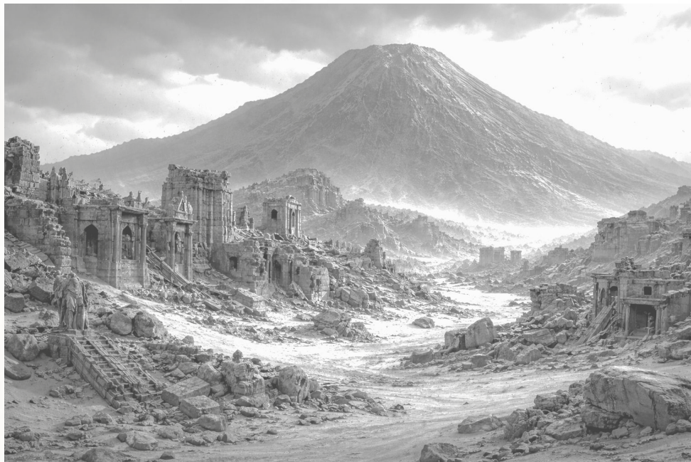
The ruins of the Ember Throne destroyed during the sundering when the volcano was last active

A series of tremors has been felt across the Desert this past week, rattling caravans, splitting old stone markers, and sending shockwaves through the nomad camps from dusk till dawn. While no major damage has yet been reported, the quakes have renewed long-standing fears that The Ember Peak, dormant for hundreds of years, may be stirring once more beneath the sands.