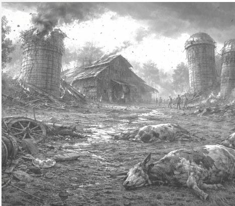
Field in southern Dawn Empire left in ruin after fatebreakers reportedly summon eldritch being

The Fatebreakers, best known as the leading figures of the OFC and widely regarded as a destructive, yet ultimately beneficial, force within the realm, were sighted yesterday travelling north from Blackwall across the water toward Snowport. Witnesses report the group departed in haste, leaving behind the usual trail of speculation, minor property damage, and unresolved questions.